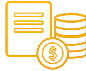
Personal and business financial administration. Monitoring of invoices, payments and banking