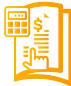
Bookkeeping, Accounting and Tax Planning