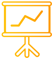
Analysis and creation of companies or restructuring already established companies